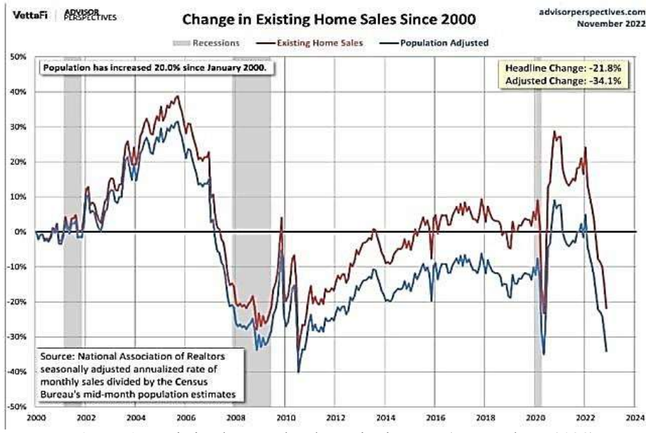
Figure 1 – Existing home sales dynamics in USA (Katsenelson, 2022)

From January, 2022 to November, 2022, existing home sales plummeted from 6.5 million a year to 4.09 million a year (minus 37 %) with sustained momentum to renew the low of the COVID crisis (about 4 million sales in mid-2020). In monetary terms, current sales are approximately $ 320-330 billion per year compared to $ 530-550 billion in 2021 (volumes are falling and prices are falling). Nearly 200 billion revenue cut-off and only one segment – new single-family homes (Katsenelson, 2022).